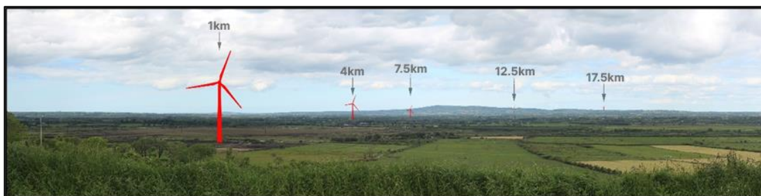
Figure 1-1: Effect of Distance on the Visibility of Wind Turbines (illustrative purposes only).